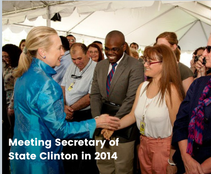
Meeting Secretary of State Clinton in 2014