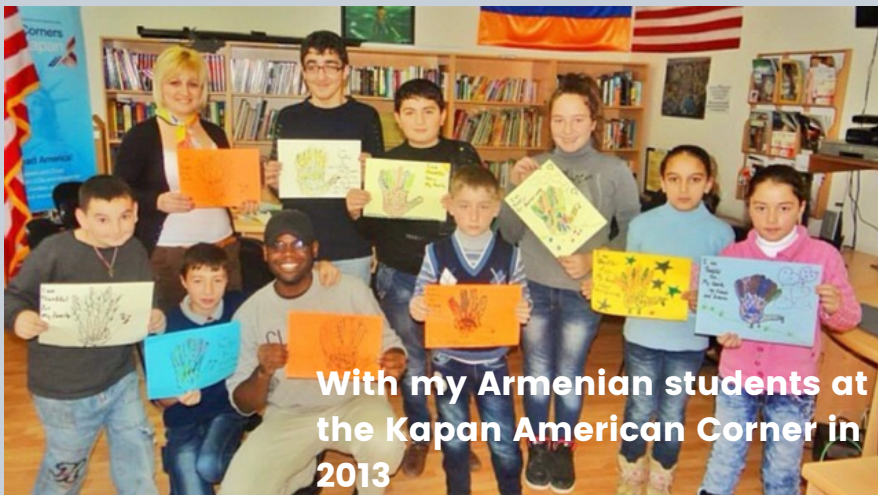
With my Armenian students at the Kapan American Corner in 2013

As a Community Development Specialist, I organized country-wide partnership initiatives to support youth literacy and public health awareness.